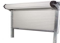
Roll Up Doors