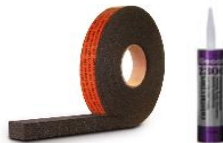
Tube and Tape Sealant